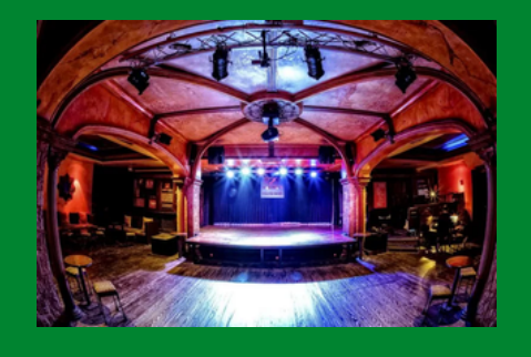
Concert and Performance Halls