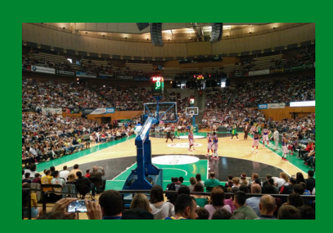
Sports Pavilions and Stadiums